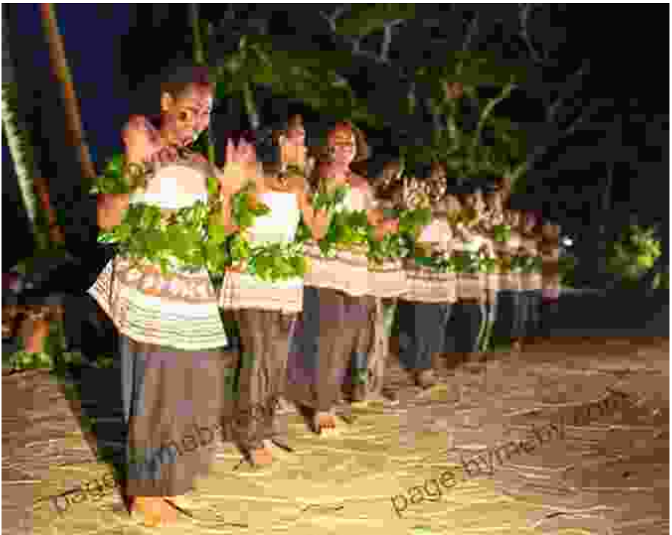
Connecting with the Heart of Fiji

With Moon Travel Guides, you'll venture beyond the tourist traps and discover the hidden wonders of Fiji. Immerse yourself in the vibrant atmosphere of a traditional Fijian village, where you can witness ancient ceremonies and learn about the local way of life. Hike to remote waterfalls, where you can cool off in the crystal-clear waters while surrounded by lush vegetation. Or charter a boat to explore the pristine Yasawa Islands, where you can snorkel with manta rays and soak up the unspoiled beauty of untouched beaches.