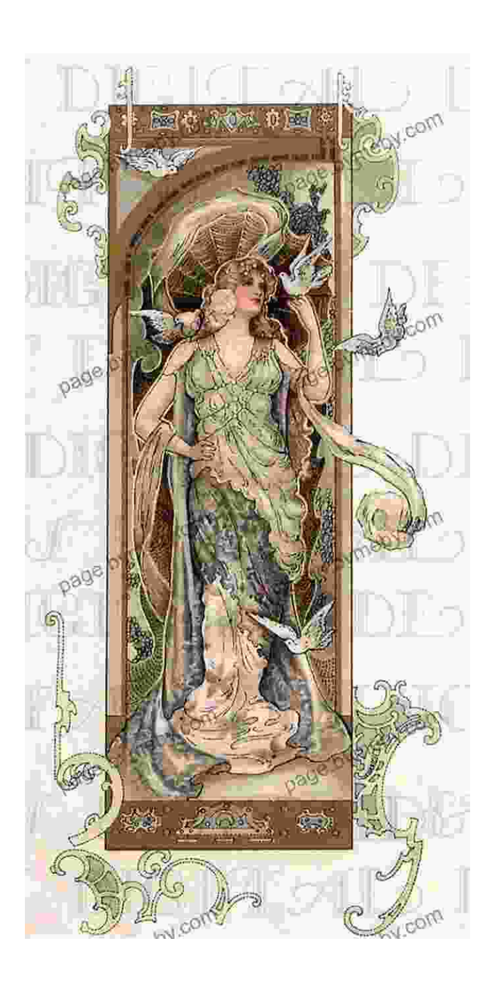
Stories Woven Into Every Image

The postcards featured in 'Flights Into The Foreign Vintage Departures' are not mere pieces of paper; they are miniature works of art. Expertly crafted with intricate designs, vivid colors, and captivating imagery, these postcards showcase the artistic talents of their creators. From the Art Nouveau flourishes of the early 20th century to the bold graphics of the mid-century, each postcard reflects the artistic sensibilities of its era.