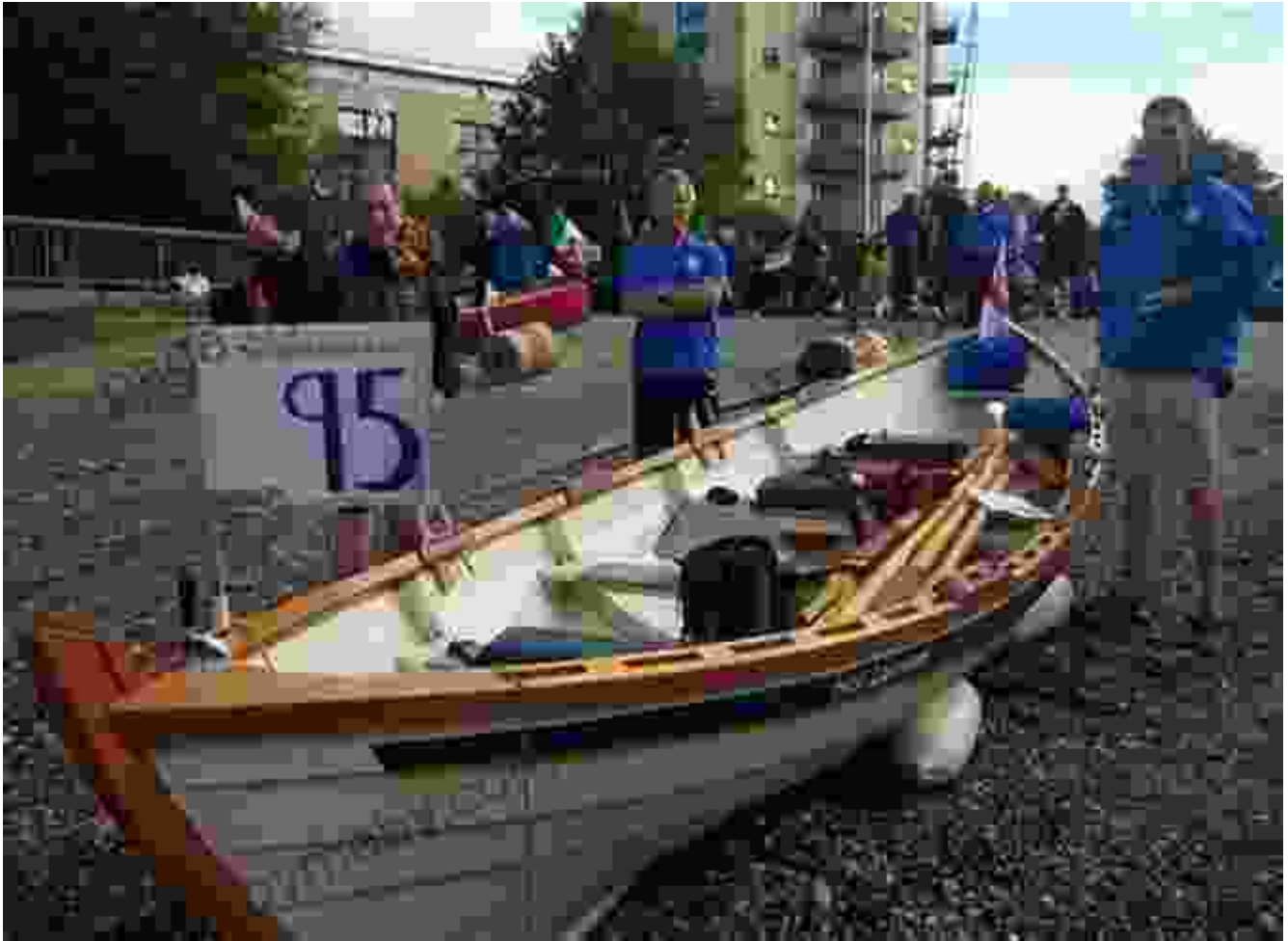
The St. Ayles Skiff